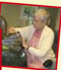
Making zucchini cake