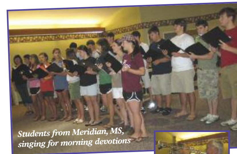
Students from Meridian, MS, singing for morning devotions