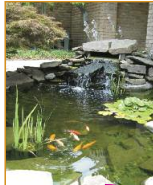
The fish pond in Cedar Courtyard