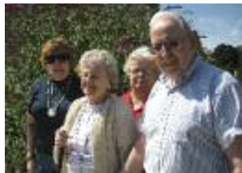
Group of walkers on the outside walkway