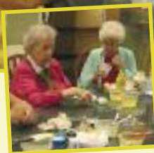
Making deviled eggs