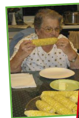
CORN ON THE COB - A SUMMER FAVORITE...