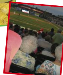
ALONG WITH BASEBALL!