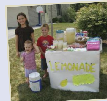
Country Drive with stop at Denlinger's Lemonade Stand