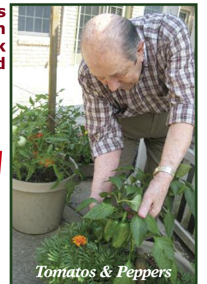
Tomatos & Peppers